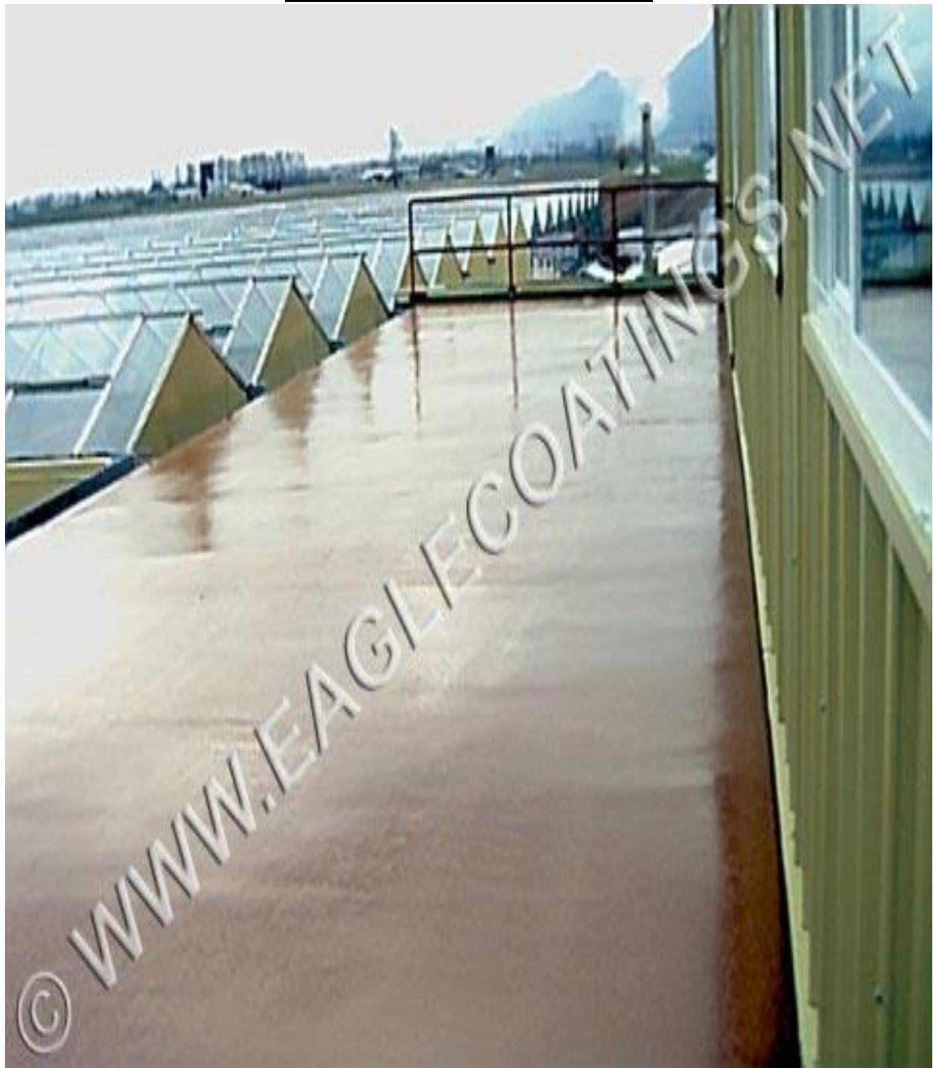
\underline{\text{NON-SKID}} \circledast - High Gloss as a waterproof, non slip thin film deck coat

Eagle Specialized Coatings And Protected Environments | a Division of DW PEARCE Enterprises Ltd. (1979) Tel: (604) 576-2212 • Email: info@eaglecoatings.com • Web: www.eaglecoatings.com